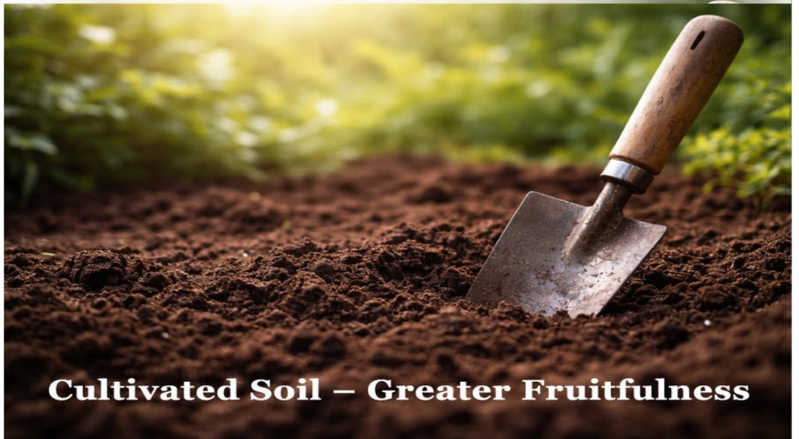
Cultivated Soil – Greater Fruitfulness