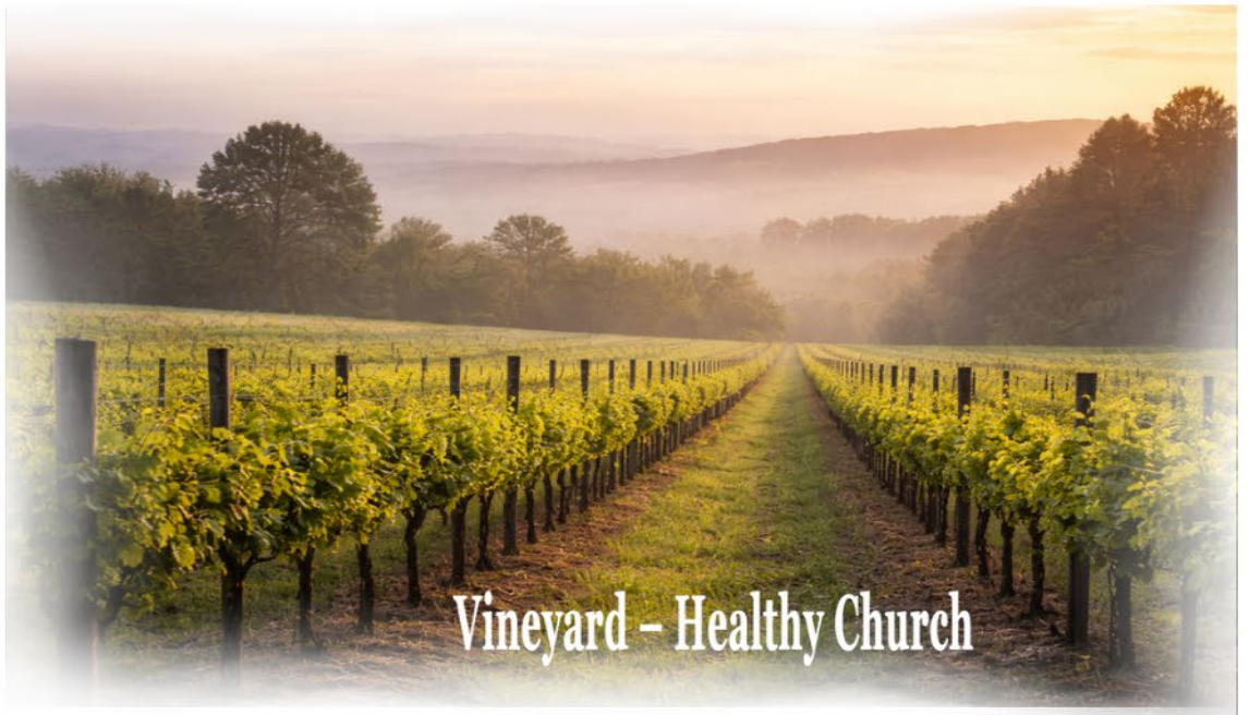
Vineyard – Healthy Church