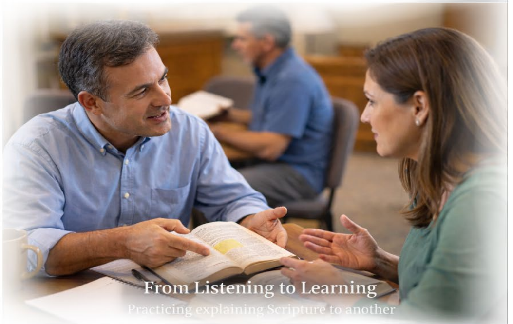
From Listening to Learning Practicing explaining Scripture to another