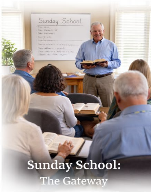
Sunday School: The Gateway