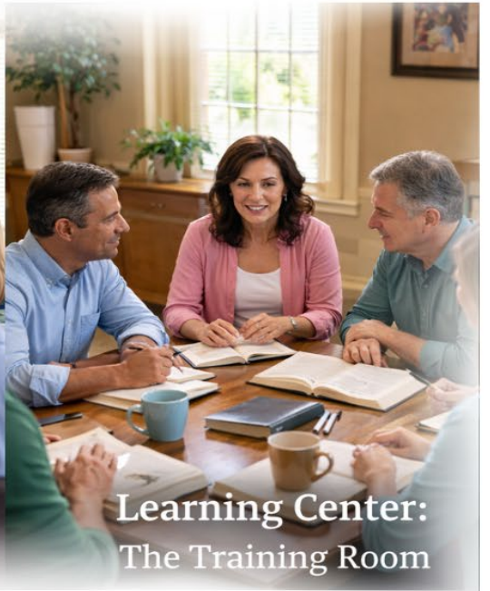
Learning Center: The Training Room